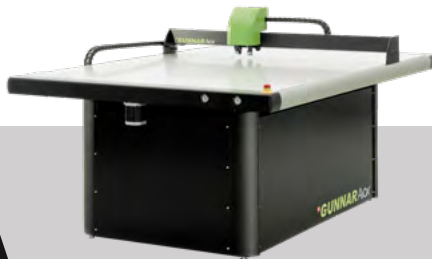
GUNNAR AiOX Professional XL