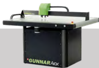
GUNNAR AiOX Professional M