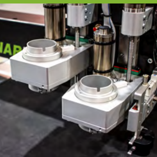
Twin Tool Adapter