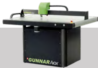
GUNNAR AiOX Hybrid M