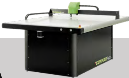
GUNNAR AiOX Hybrid XL