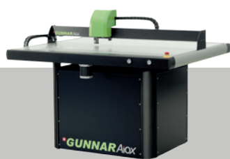
GUNNAR AiOX Basic M