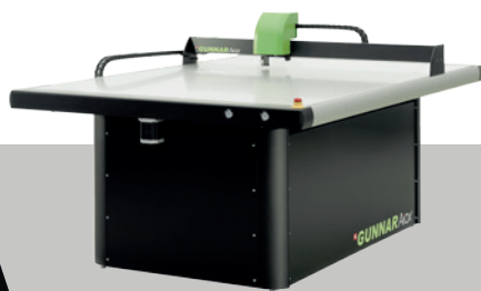
GUNNAR AiOX Hybrid XL