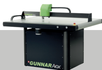
GUNNAR AiOX Hybrid M